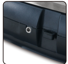
Power jack for adaptor